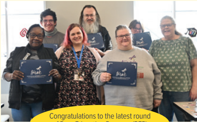
Congratulations to the latest round of Peer Education Program (PEP) graduates at TMWC!