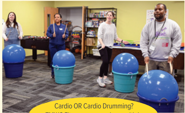
Cardio OR Cardio Drumming? TMWC Fitness program has multiple options to get you moving!