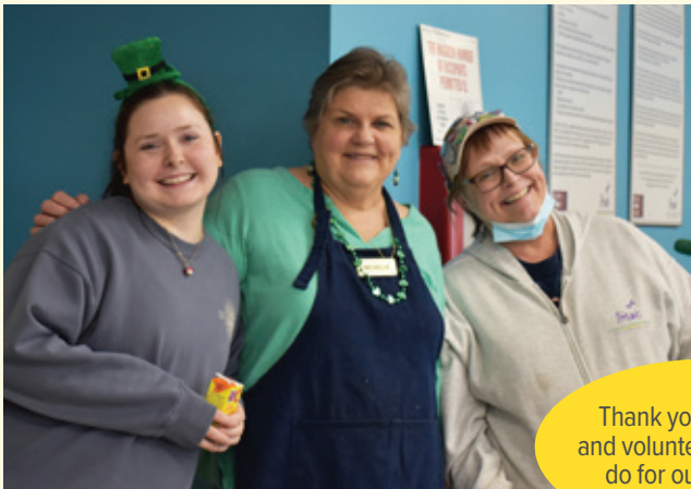
Thank you to our staff and volunteers for all they do for our members.